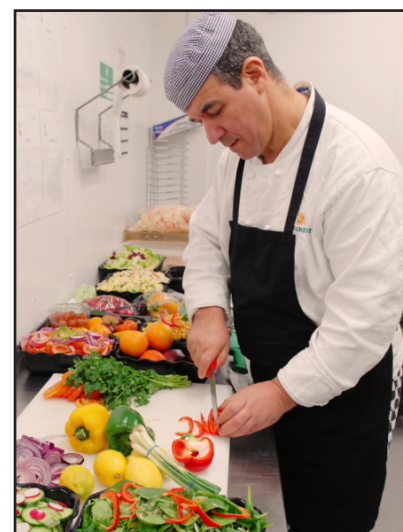
Photos illustrate example of a PKL large scale modular kitchen facility